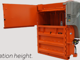
Regular door for extra low installation height.